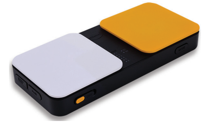
Blue2<sup>™</sup> Bluetooth<sup>®</sup> Switch (New model)

One or multiple external switches can be used with Switch Control. The Blue2 Bluetooth switch connects to the iDevice via a Bluetooth connectio and provides one or two external switch inputs.