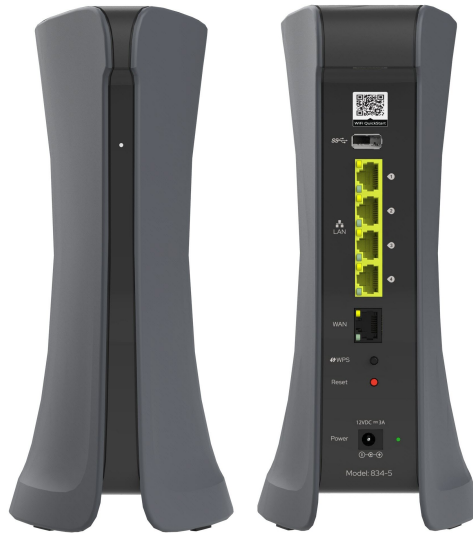
Figure 1. Front and Back of the 834-5 Gateway

Figure 1 illustrates the front and back of the 834-5 gateway.