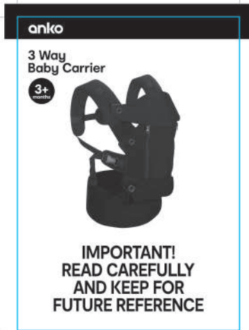
P4 8.5 cm

CARRYING BABY FACING FORWARD WARNING: This position should only be used for baby who can hold up his/her head unsupported (approximately 6 months old) and is tall enough for his/her head to be above the folded headrest. Follow the instructions as per steps 1, 2 and 3 on page 3. Place your baby facing away from you. Fold down the headrest (5), then connect the panel button (4). CARRYING BABY ON THE BACK (6 months+) Step 1: Secure baby carrier without your baby by fastening the shoulder strap buckles (7), leg support button (8) and head support button (3). Put baby carrier on your back and breathe in deeply and attach the touch fastener of the waist belt as tight as you can. Fasten the waist belt buckle (11), pull the strap until snug and pack up the overlong safety belt. Step 2: With the help of a second person, place baby on baby carrier, then put the shoulder straps over your shoulders. Step 3: Fasten the chest buckle (1). If necessary, tighten the strap until snug and/or adjust its height. Pull the shoulder straps down to tighten them until snug.