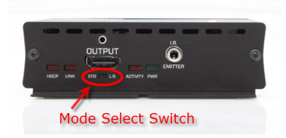
Figure 10 – Mode Switch

Two modes are available: Standard (STD), and Long Reach (L.R.). If the length of UTP cable is less than 100 meters (330 ft), then STD mode should be used. For lengths above 330 ft Long Reach (L.R.) mode must be set.