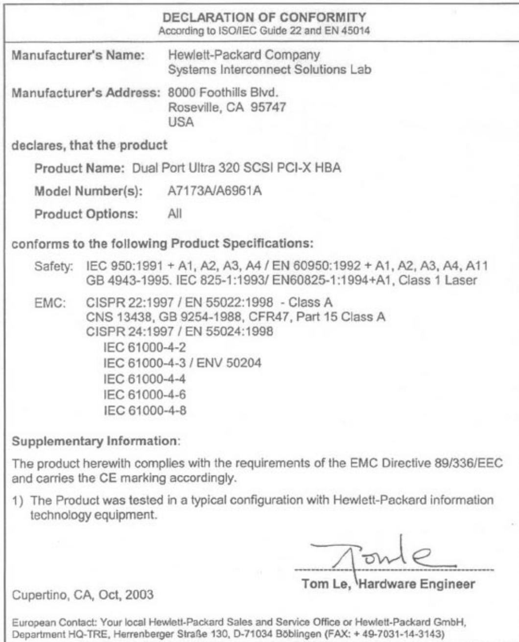
Figure A-1 A7173A Adapter Declaration of Conformity