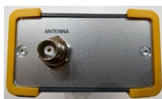
iQRadio view top side

The ethernet connector is for future use and inactive.