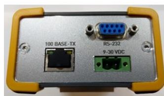
iQRadio view bottom side