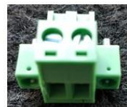
POWER CONNECTOR cabel part (Wurth# 691343710002)