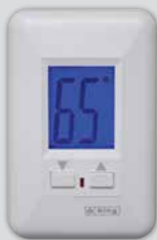
ES120 ES230 Non Programmable