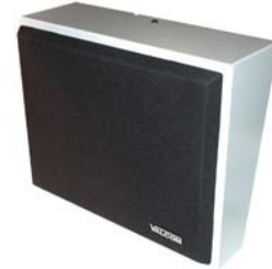
V-1052C Amplified Wall Mount Speaker Gray w/Black Grille

The interior wall speaker, the V-1052C, is a 8" Speaker/Amplifier Assembly capable of reproducing paging as well as back ground music. This speaker has an externally accessible volume control located behind the grille and is screwdriver adjustable. The enclosures are made of steel with a durable powder coated finish. The color of the enclosures can easily be changed to match any decor. A cloth covered detachable grille is included. The speaker requires -24VDC, 50mA (1 power unit).