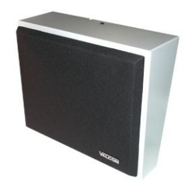
V-1071 Talkback Wall Mount Speaker Gray w/Black Grille

Consult Valcom's VSP - Handsfree Talkback Paging (Part # 947099) for detailed information on selecting the control unit and power supply.