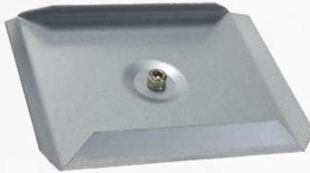
12V SPINNER PLATE