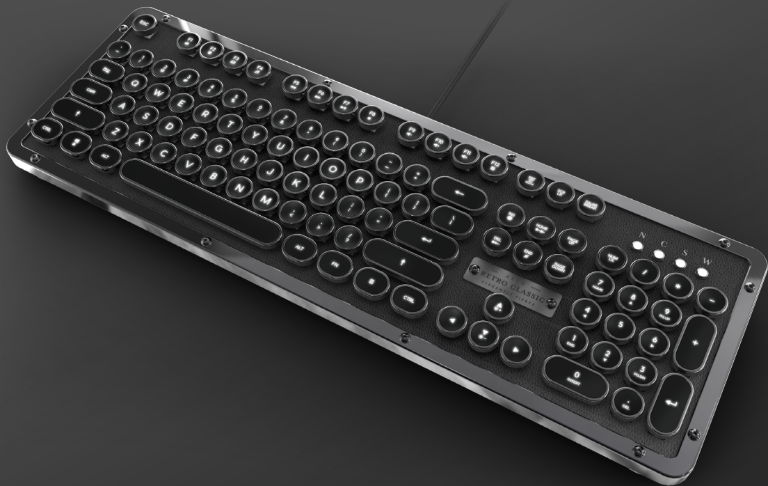
AZIO RETRO CLASSIC