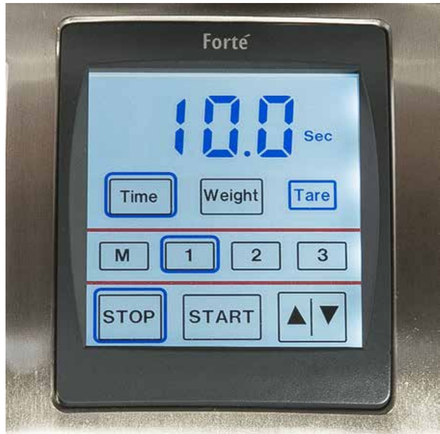
All Weight and Time settings are made using the touch screen.

grinder will only allow a maximum of 120g to be ground at one time. At any time, during grinding, you can stop the unit by pressing the STOP button. The motor will stop and the screen will reset to the selected preset weight. You can also press M (Manual) grinding, and use the START and STOP buttons to grind to the desired weight to a maximum of 120g.