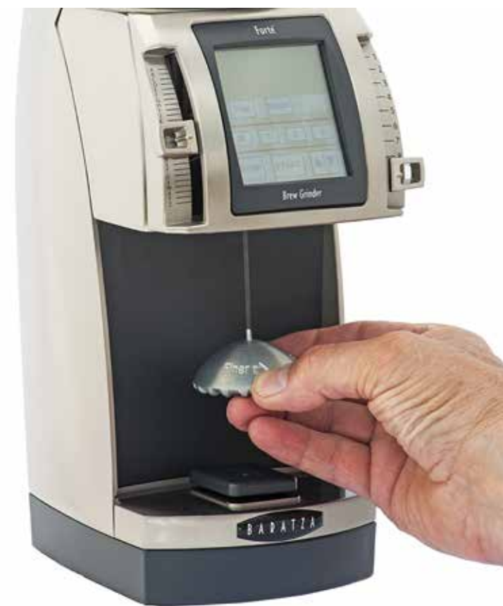
Use the burr calibration tool while the grinder is running.

Turn the grinder on and lower the Macro and Micro levers, all the way to the bottom. Let the grinder run long enough to expel any remaining ground coffee. Remove the grounds bin (For Vario-W and Forte , TARE the grinder). Now press any one of the preset buttons, then press START and insert the Calibration tool into the 2mm Allen head screw (The grinder will run until you press the STOP button). With the motor running, move the Macro arm up to the top (setting 1). You should not hear any change in motor speed. Now, slowly move the Micro arm up to the midpoint(setting M). If the motor hasn't started to slow, use the calibration tool to turn the calibration screw toward the finer direction (as indicated on tool) until you hear the motor start to slow. This setting will allow for a full range of grind. If you want a coarser grind, insert the tool and turn the opposite direction of the arrow on the tool.