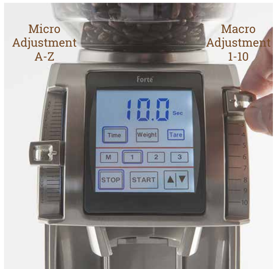
The Forté™ must be running when grind adjustment are made.

The full range on the Micro scale is equal to one “click” or position change on the Macro scale. Adjusting levers UP produces a smaller particle size, adjusting levers DOWN produces a larger particle size.