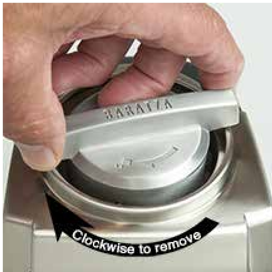
Turn burr clockwise to remove

Wash the grounds bin, hopper, and the hopper lid in warm soapy water, then rinse and dry.