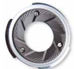
Ceramic burr (Forté™-AP Brew Grinder)