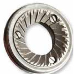
Steel burr (Forté™-BG)