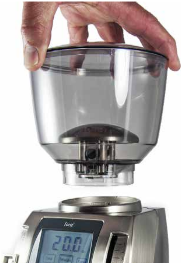
Picture hand placing hopper on housing.

Place the VARIO-W grinder on a level surface. With the hopper lid in place, mount the hopper on the grinder housing by lining up the two small tabs at the base of the hopper with the two slots inside the collar on the top of the grinder. The Open/Closed lever should be oriented to the back of the grinder.