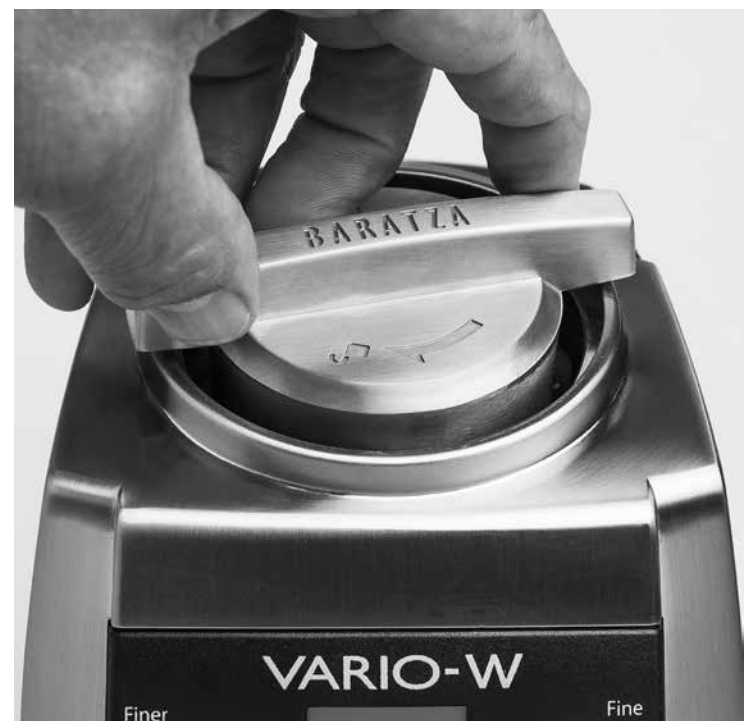
Rotate Baratza burr tool clockwise to remove the burr carrier.

Using the Baratza Burr Tool included with the grinder, rotate the metal burr carrier clockwise about 1/6th of a turn, then lift the burr carrier straight up and out of the grinder housing. You may need to wiggle the burr carrier a little to get it free.