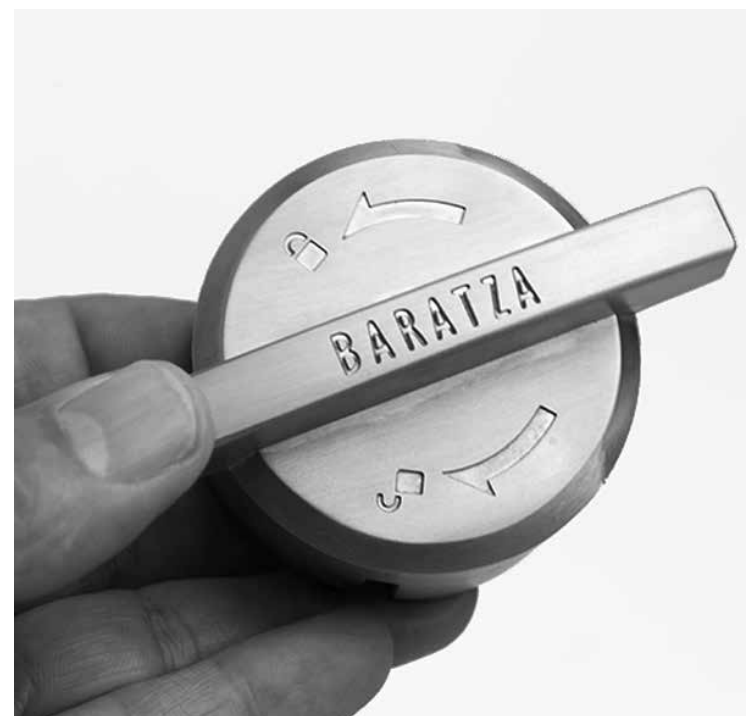
Rotate burr carrier counter clockwise to lock in place.