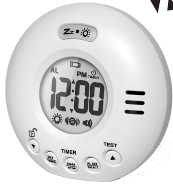
Snooze / Flashlight