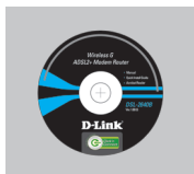
CD-ROM (D-Link Click'n Connect. Manual and Warranty)