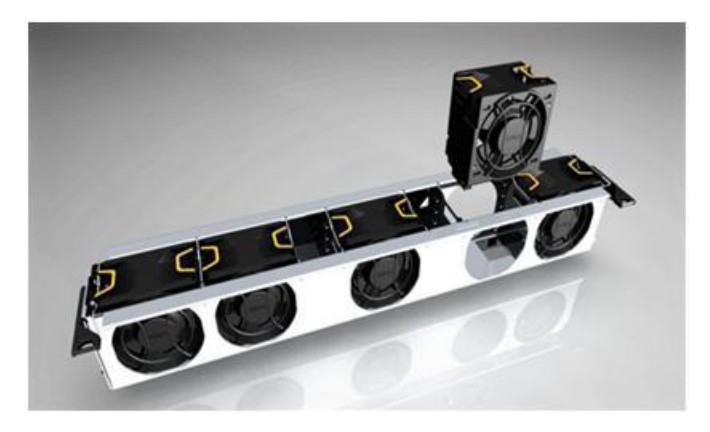
Figure 7. Fan Gantry

Five hot-swappable fans are mounted in a fan gantry that is located in the chassis between the hard drive bay and the processors. See Figure 7. Each fan has a blind mate 2x2 connector that plugs directly into the planar. There is an additional fan integrated in each power supply to cool the power supply subsystem and also provide additional cooling for the whole system. Single processor configurations have four fans populated.