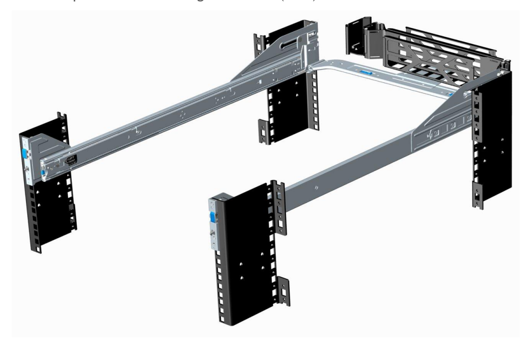
Figure 11. R710 Sliding Rails with Optional CMA

The sliding rails allow the system to be fully extended out of the rack for service and are available with or without the optional cable management arm (CMA).