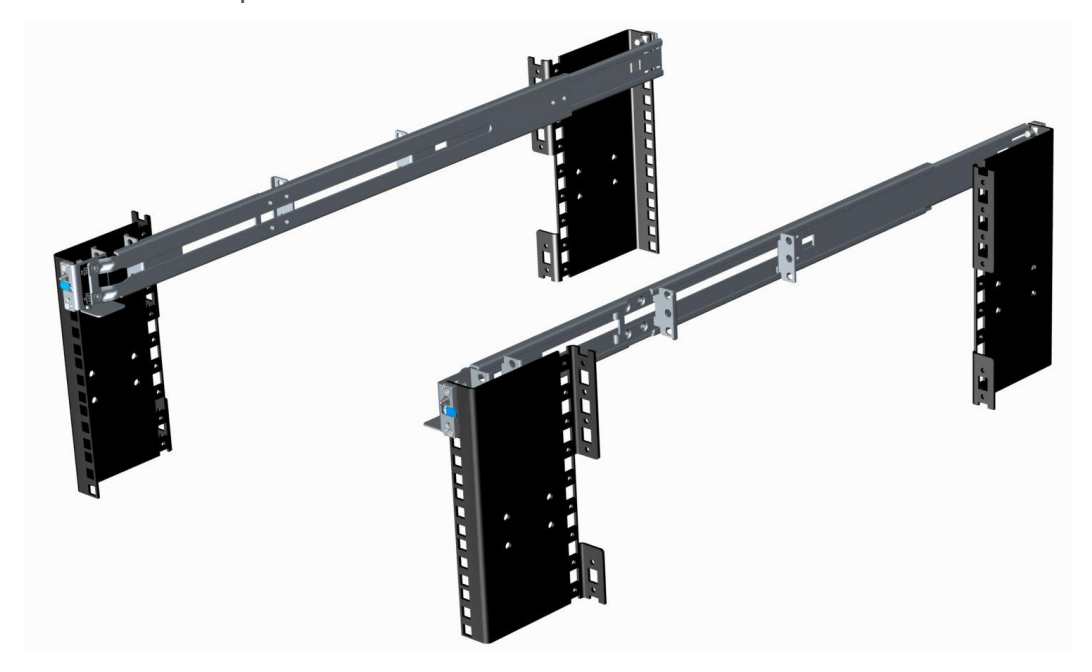
Figure 13. R710 Static Rails

The static rails support a wider variety of racks than the sliding rails but do not support serviceability in the rack and are not compatible with the CMA.