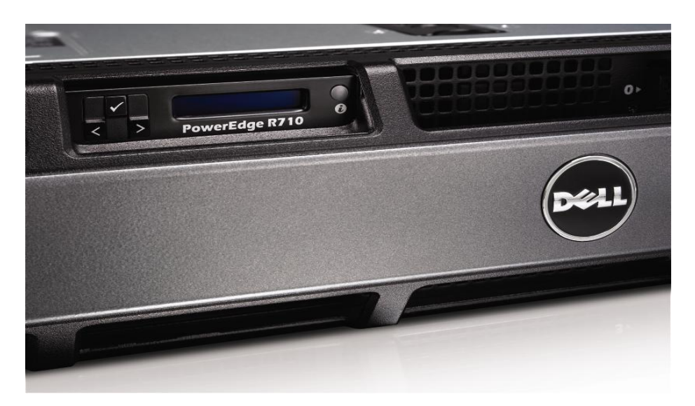
Figure 8. Control Panel

The LCD panel is a graphics display controlled by the iDRAC6. Both iDRAC6 and BIOS can send error codes and messages to the display.