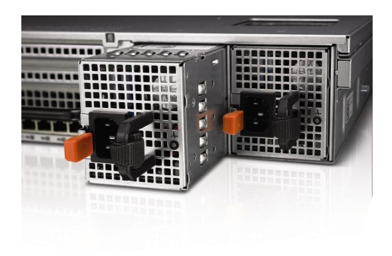
Figure 9. Power Supplies