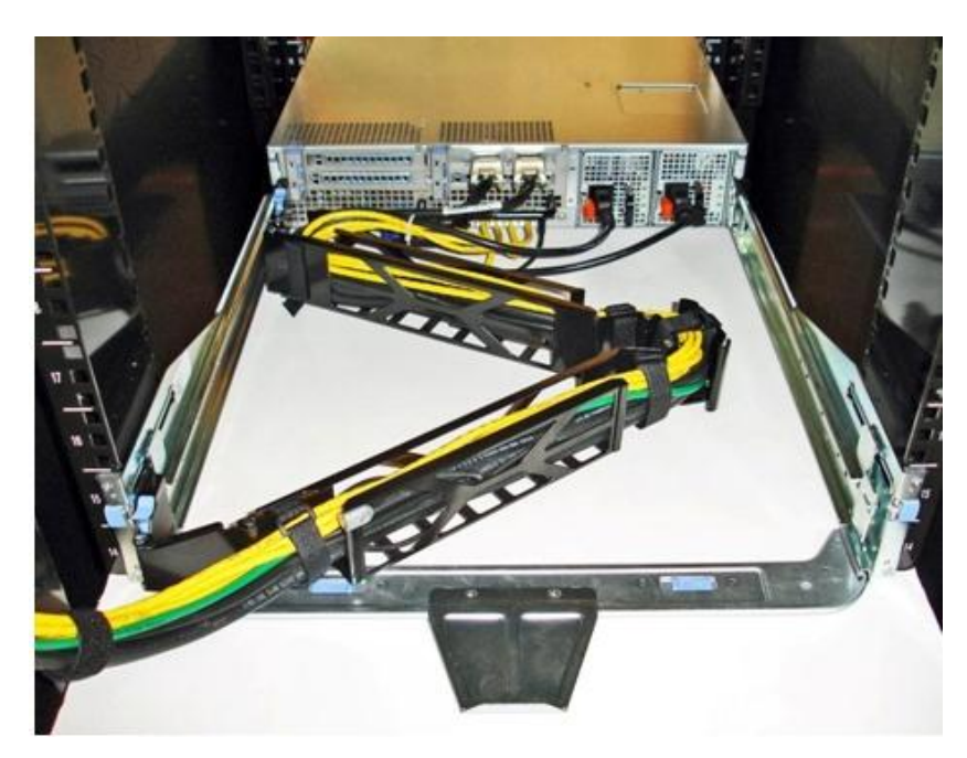
Figure 15. R710 Mounted in the B1 Sliding Rails with the CMA

The CMA can be mounted to either side of the rails without the use of tools or the need for conversion, but it is recommended that it be mounted on the side opposite the power supplies to allow easier access to the power supplies for service or replacement. See Figure 15.