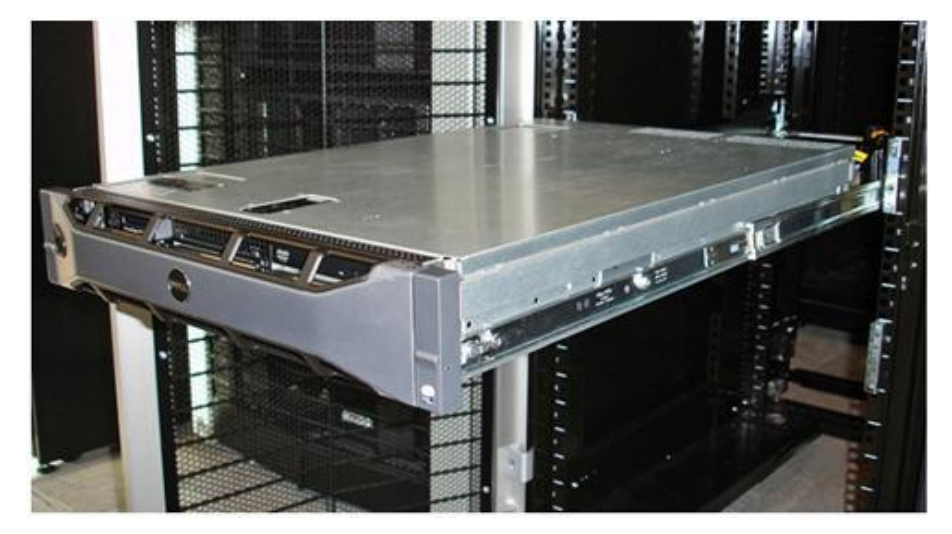
Figure 14. R710 Mounted in B1 Sliding Rails

The CMA can be mounted to either side of the rails without the use of tools or the need for conversion, but it is recommended that it be mounted on the side opposite the power supplies to allow easier access to the power supplies for service or replacement. See Figure 15.