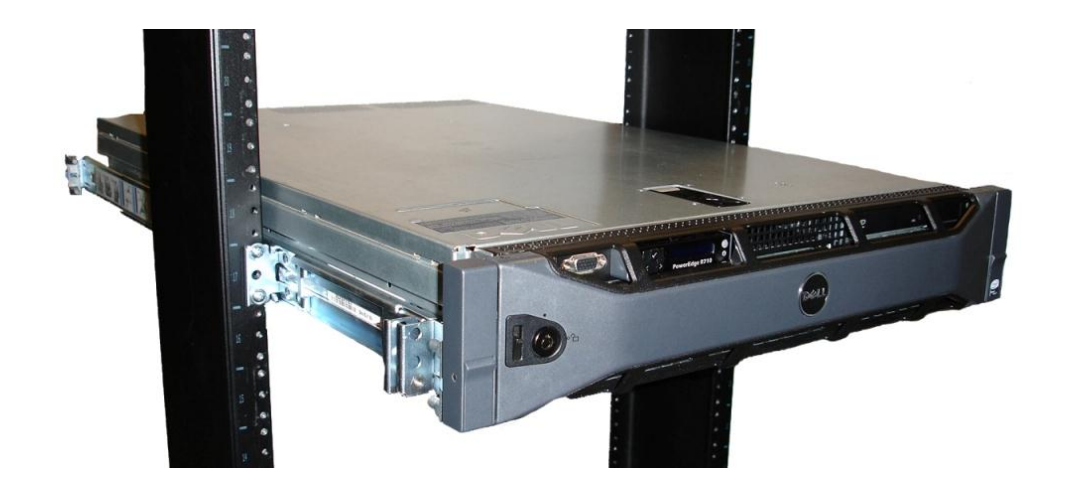
Figure 16. R710 Mounted in the A2 Static Rails (2-post Center Mount Configuration)