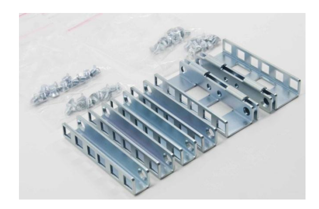
Figure 12. 2U Threaded Rack Adapter Brackets Kit

The static rails support a wider variety of racks than the sliding rails but do not support serviceability in the rack and are not compatible with the CMA.