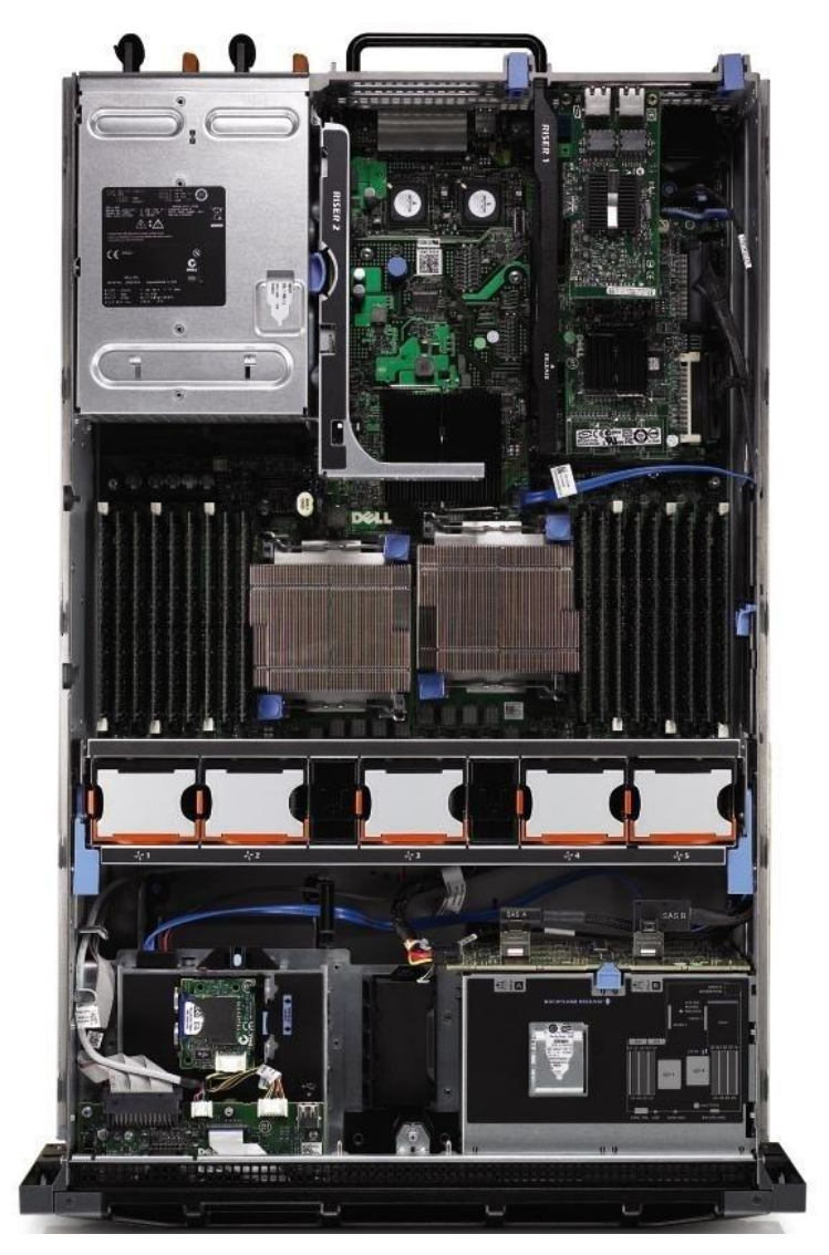
Figure 6. Internal Chassis View