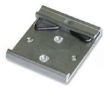
DIN rail mounting bracket Digi part number 76000682