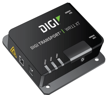
TransPort WR11 XT