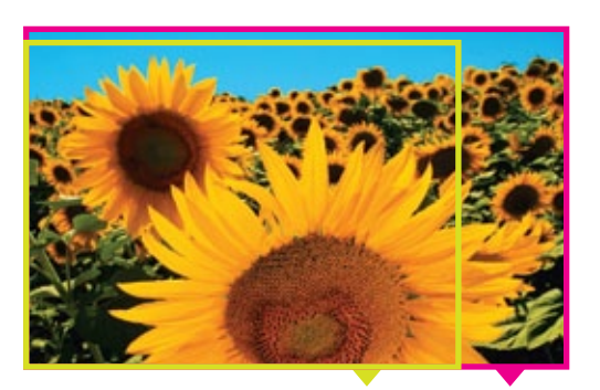
XGA 1,024 x 768 PIXELS

Choose from XGA ( 1024 \times 768 ) or widescreen WXGA ( 1280 \times 800 ) resolution. WXGA is the standard resolution in most technology devices today and has been widely adopted in business and education.