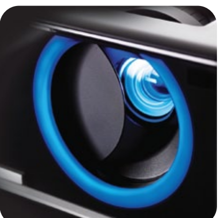
ocus iens cap silaer

"We factored in customer feedback on our award-winning IN3100 series and made it even better. Better lens, audio, control, JPEG playback and integrated networking designed into the IN3100 sets a new standard for high performance meeting room projection."