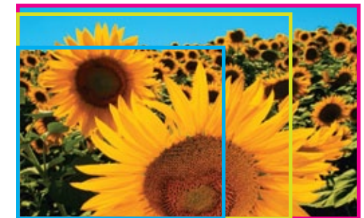
SVGA 800 x 600 PIXELS XGA 1,024 x 768 PIXELS WXGA 1,280 x 800 PIXELS