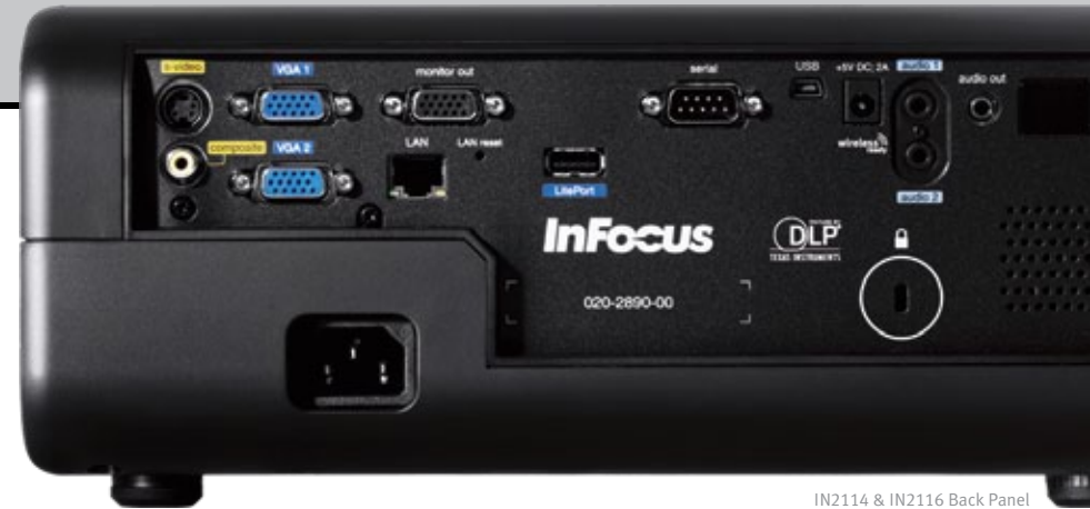
IN2114 & IN2116 Back Panel