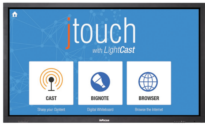
65" JTouch Whiteboard with LightCast (INF6501c)