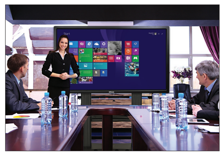
80" BigTouch (INF8012)