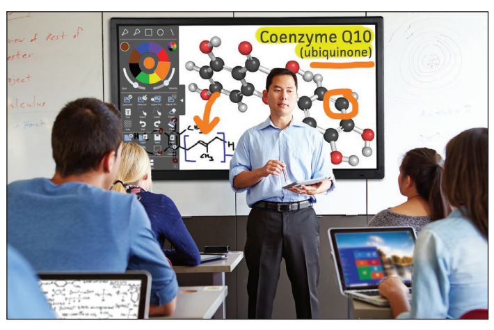
65" JTouch Whiteboard with LightCast (INF6501c)