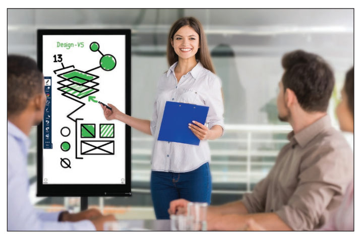
40" DigiEasel (INF4030)