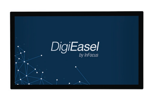
DigiEasel works in either portrait or landscape mode.