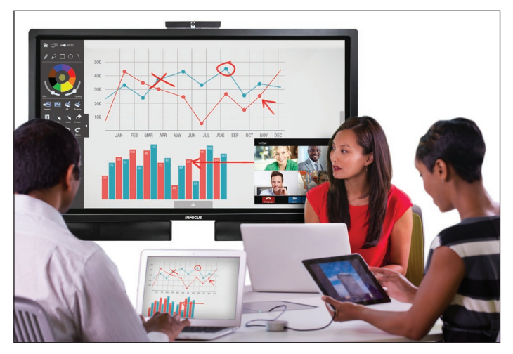
70" Mondopad (INF7021)