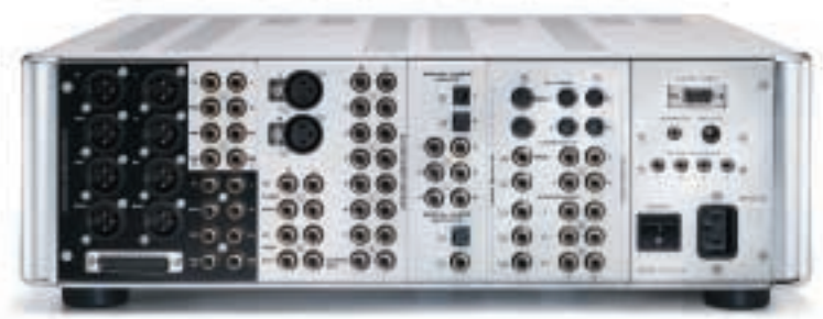
HTS 7.1 rear panel shown.

movie soundtracks and high-resolution audio formats. In Preamp mode, the HTS 7.1 operates as a pure analog preamplifier, bypassing all digital ciruitry to ensure the cleanest, most direct signal path.