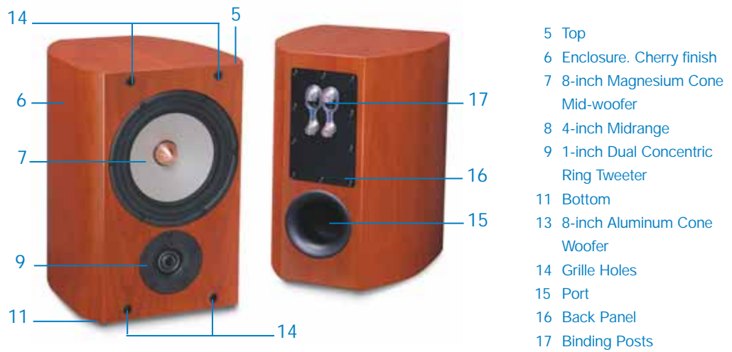
Figure 4 Resolution C Front and Back Panels