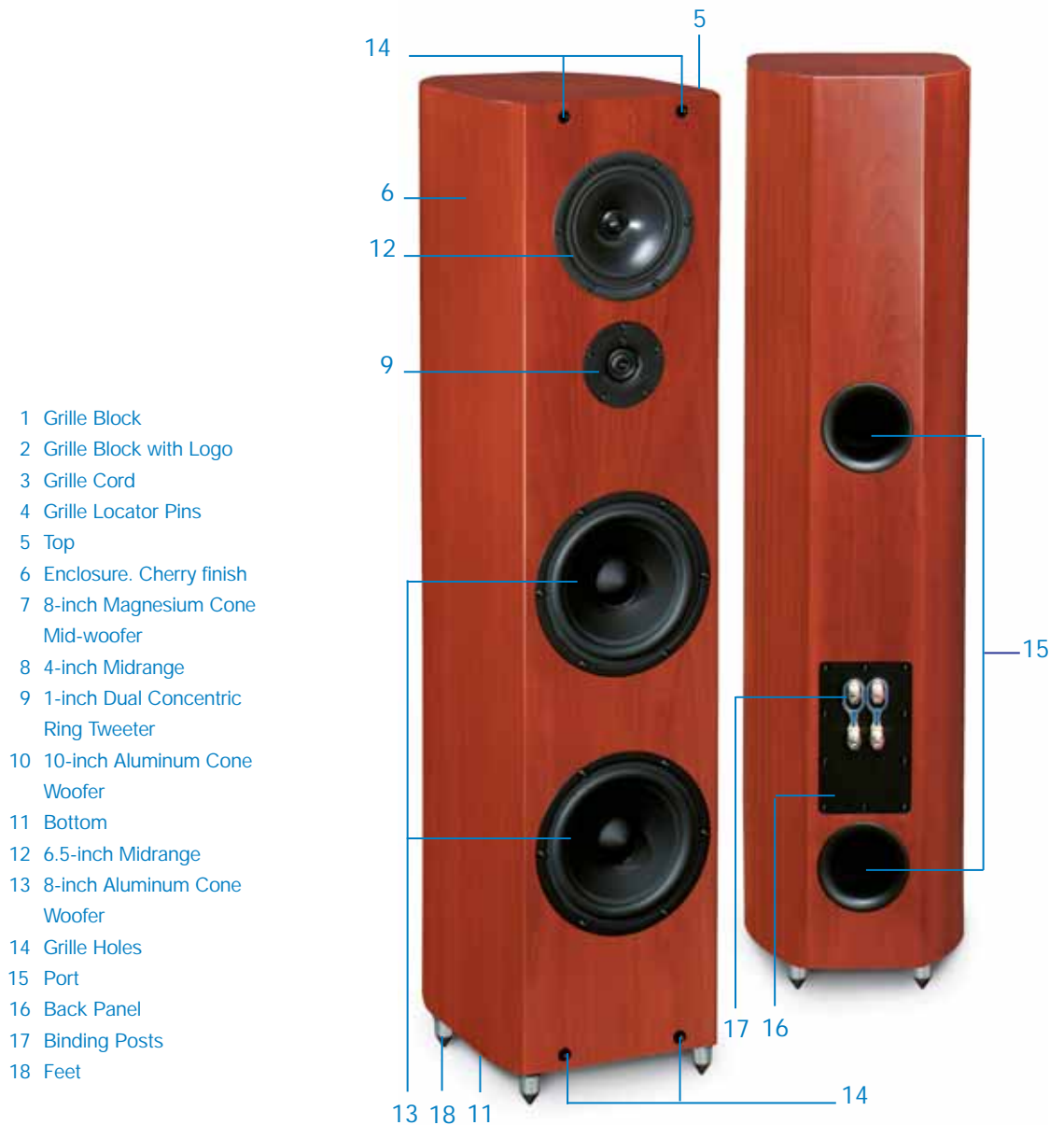
Figure 2 Resolution 2 Front and Back Panels