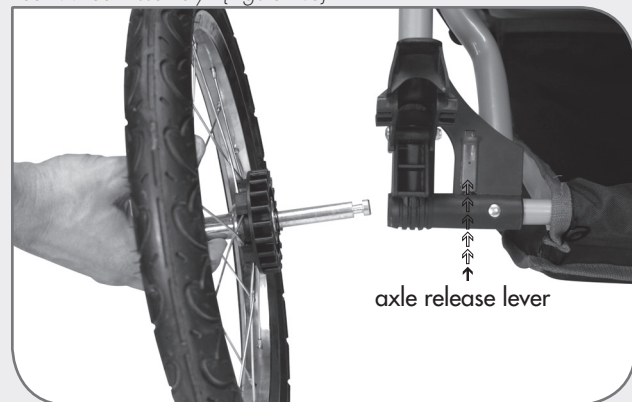
Rear Wheel Assembly - {Figure 1.b}

Grasp rear wheel in one hand, slide wheel's axle into hole in rear of frame. Push up on the axle release lever so that the wheel is fully inserted. Pull the wheel firmly, the wheel should not come off if fully inserted/locked. Repeat for other side. To release wheel push up on axle release lever and pull off wheel.