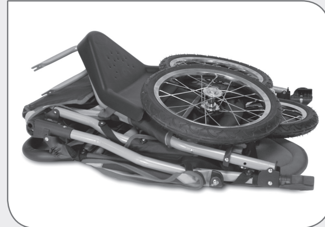
Storage and folding

Remove locking pins from side latches on the stroller frame (Double Models have 2 locking pins). Release the two latches from the frame. The stroller may automatically begin to fold, the front wheel will fold under frame and the handle will fold backwards. For a more compact fold remove front and rear wheels