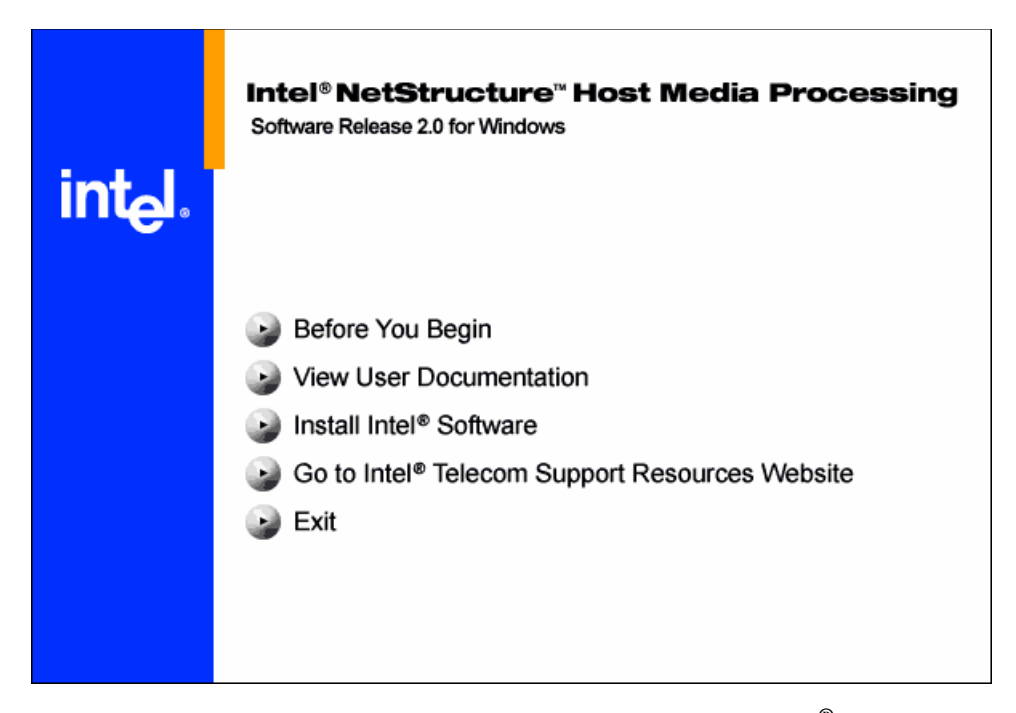
Figure 2. HMP Software Navigation Screen

When you are ready to proceed with the installation, click on Install Intel<sup>®</sup> Software.