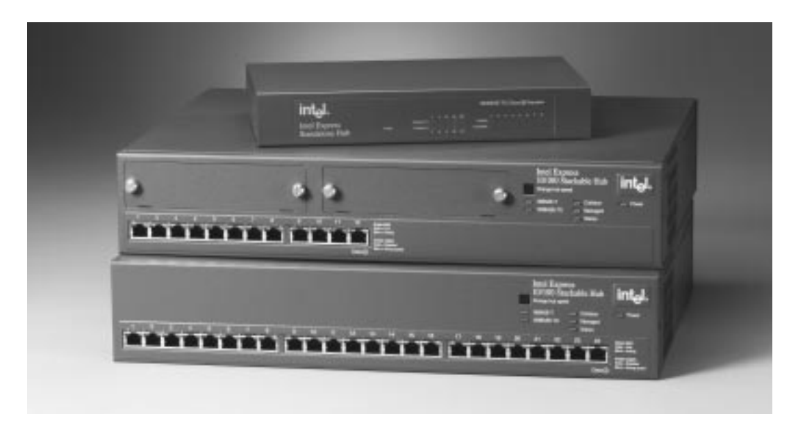
Intel Express Hubs offer a flexible transition to Fast Ethernet performance for any size network.

Intel Express Hubs are a family of Ethernet and Fast Ethernet products designed to increase your network response time. They help you move toward Fast Ethernet performance in a gradual, cost-effective transition, realizing performance gains in key network segments as you go.