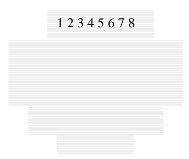
Figure 2 8-Pin MJ Connector (Front)

Each of the Four 8-pin MJ connectors for 10/100 Mb/sec are wired as shown in Figure 2: