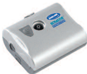
Stratos Portable Plus