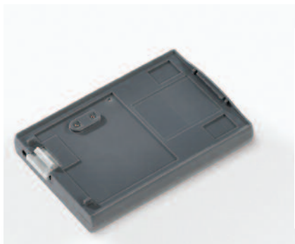
IRC1731 Battery Pack (sold separately).