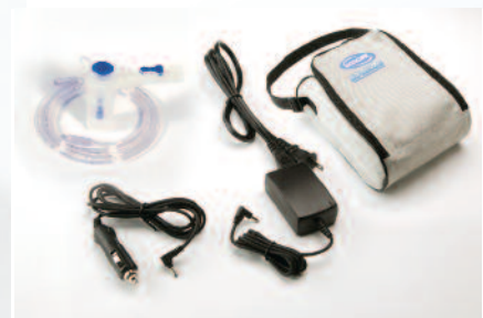
Reusable nebulizer with tubing, DC car adapter, AC power cord and carrying case all come standard with Stratos Portable Plus unit.