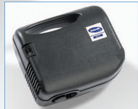
Convenient carrying handle for ease of transportation.