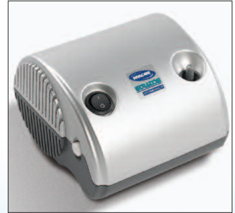
IRC1710 Stratos Compact Aerosol Compressor.