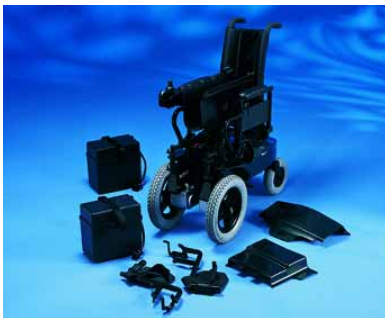
Disassembled for transport.