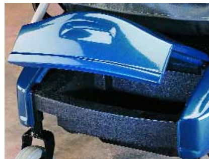
Trunk for storage of personal items.