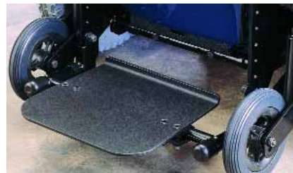
Height-, depth-, and angle-adjustable flip-up footplate.