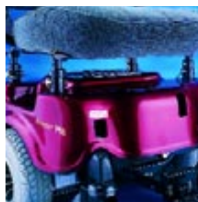
On-board battery charger means easy charging.