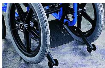
Available with swing-under footrest for easier transfers.