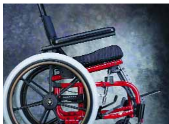
The mini-tilt option is a simple and lightweight feature that provides up to 20° of tilt.