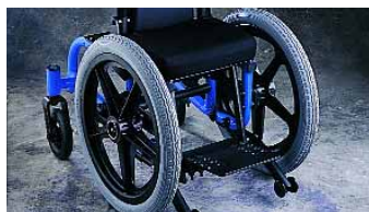
The Comet can be reversed with no additional parts required.