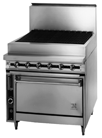
JTRH-36B-36 with optional high riser.