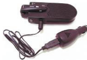
Charging the docking base