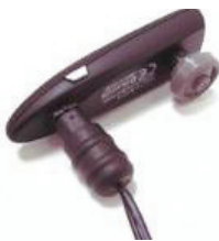
Charging the headset