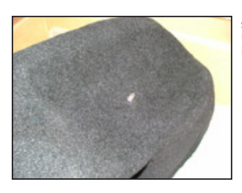
STEP II Unpack Stealthbox<sup>®</sup> and install mounting stud into threaded insert so that 1/2 to 3/4 inch extends from enclosure.

STEP 7 Remove passenger side cargo panel by prying away from side of vehicle and floor.