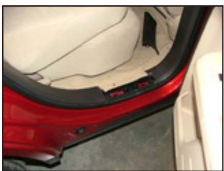
STEP 5 Remove passenger side threshold plate.

Remove passenger side taillight assembly by removing (2) 8mm screws.