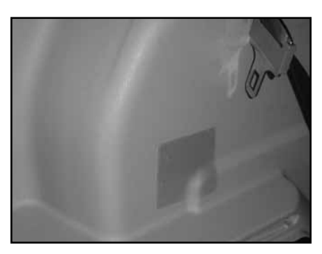
S T E P 2 From inside the SUV, place the supplied wax square onto the driver's side wheel well, as in the picture.