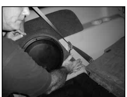
Thread the supplied socket cup screw into the rear of the

Stealthbox®, leaving 1/4-inch of the threads exposed.