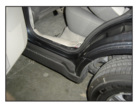
S T E P 6 Remove bottom plastic trim piece from rear left door opening.