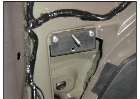
STEP 10 Mount the bracket.

The bracket will be oriented as shown with all three bolts in a straight line in the newer vehicles.