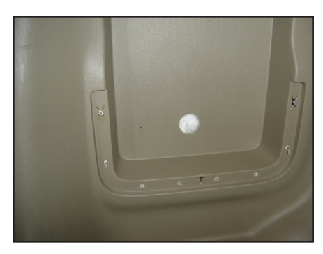
S T E P 4 Drill a 1" hole in the interior panel where marked as STEP 3 as shown.

Note: Before drilling, make sure that you are not going to be drilling into any gas lines, brake lines, transmission lines, electrical wiring, transfer case (4x4 vehicles) or anything else that might cause a reduction in your weekly pay. Always wear eye protection when drilling!