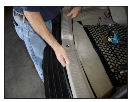
S T E P 5 Remove bottom trunk plastic trim panel as shown

Note: Before drilling, make sure that you are not going to be drilling into any gas lines, brake lines, transmission lines, electrical wiring, transfer case (4x4 vehicles) or anything else that might cause a reduction in your weekly pay. Always wear eye protection when drilling!