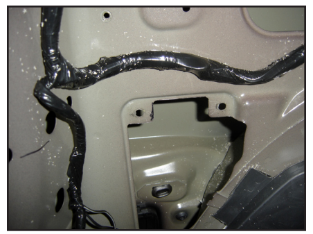
STEP 9 This shows the holes where the bracket mounts.