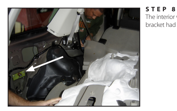
The interior with the side panel removed. Note where the bracket had been previously installed