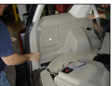
Remove side panel as shown.