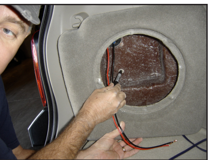
Remove the woofer from the Stealthbox®. Hold the enclosure in place and use a marker to mark the interior panel through the hole in the back of the Stealthbox®