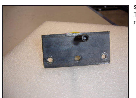
STEP 10 DETAIL (1) The bracket will be mounted as shown at left in the older model vehicles.

Please refer to the detail pictures for further clarification.