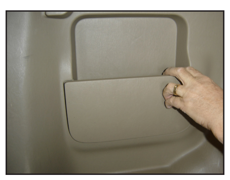
STEP 1 Remove the cover in front of the pocket as shown.