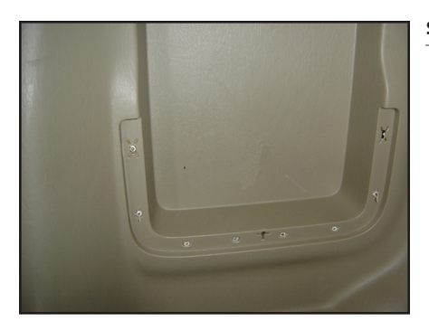
STEP 2 This is how it looks after removing the cover.