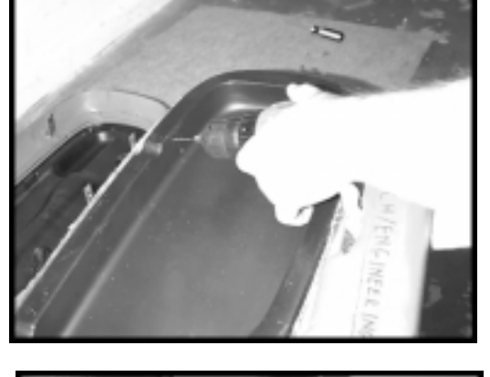
Sheet SKU#011118 Revision 5/21/01

SB-GM-BURB/10W3 - JL AUDIO, Inc 2001 • Page 5