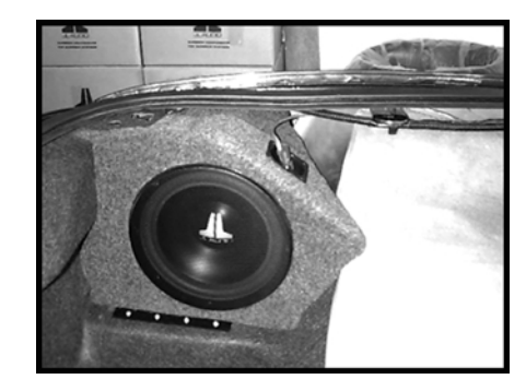
STEP 5: Run speaker wires to the enclosure. At this time, check the woofer for proper operation.

Important: Once the screws are thightened, spray under coating onto the screw tips underneath the car to prevent rust and leaks. Failure to do so may result in corrosion and could oresent a saftly hazard over time.