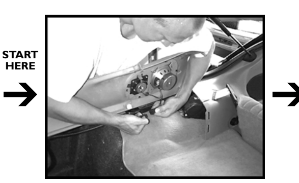
STEP I: Remove the driver's side trim panel, disconnect the speaker wires, if applicable.