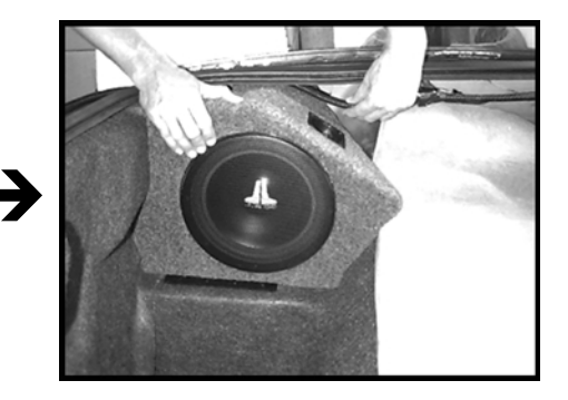
STEP 3: Insert the enclosure into the cubbyhole, taking care to loft and tuck the wiring harness above the enclosure as you slide as you slide it in. Push the enclosure firmly into place

STEP 2: Remove the driver's side carpet from the cubby-hole in the corner of the hatch. this piece of carpet will not be used in the installation. Vehicle owner should keep this carpet for possible future use, when removing the Stealthbox.