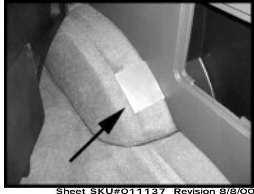
Sheet SKU#011137 Revision 8/8/00