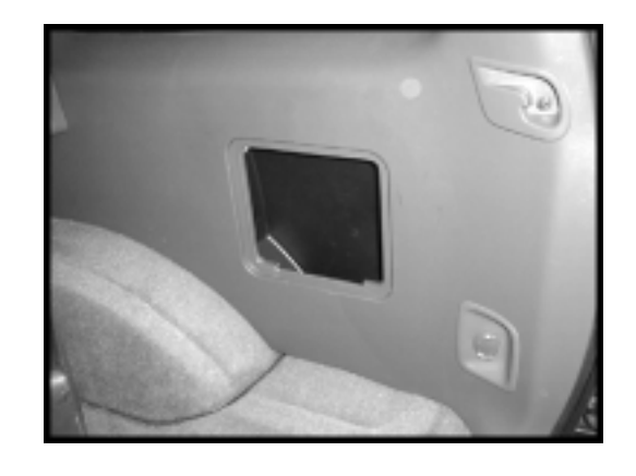
STEP 2: Place the supplied 4" x 4" wax square, sticky side down, on the wheelwell in the vicinty of the threaded insert in the Stealthbox as shown at right.