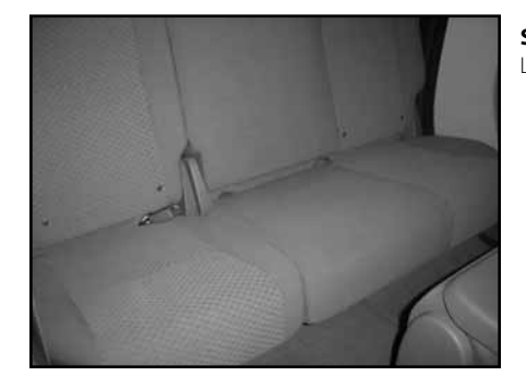
STEP 13 Lower the rear seat and replace any removed contents.