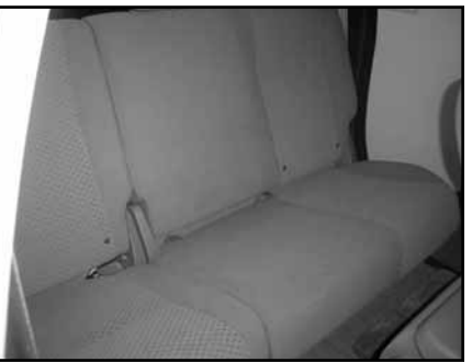
STEP 1 Remove any contents from the rear seats.