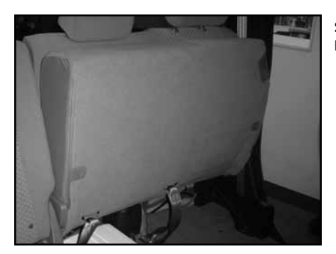
Flip up the driver's side rear bottom cushion.