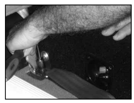
S T E P 1 2 Using the factory bolt that was removed in STEP 4, secure the L-bracket and the seat belts' mount to the floor.