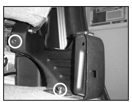
Remove the two bolts that secure the mounting foot to the rear bulkhead and floor.