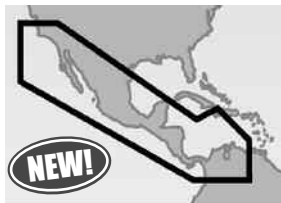
Chart Navigator Software