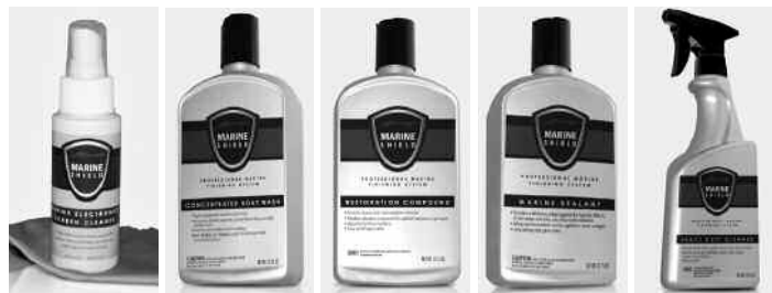
E52116 E52118 E52114 E52113 E52112

Item 751147 Model USF205NW Ship 8 lbs Net $249.99