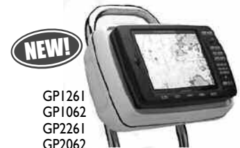
GP1261 GP1062 GP2261 GP2062