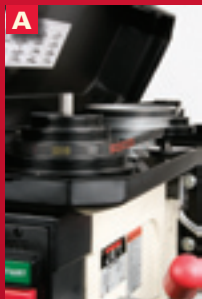
Poly-V belt drive system