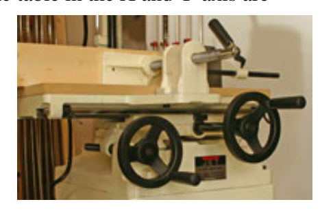
Large handwheels provide smooth, accurate control over the table movements.

individually controlled by 5"-diameter handwheels, each with a spinner knob that speeds large changes. Tool-free adjustable stops on the X-axis makes cutting multiple mortises of the same size easy and accurate. We also include a fully adjustable work stop that attaches to the top of the fence from either side to make initial positioning of the material quick and repeatable.