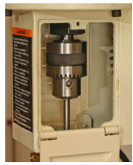
Swing down doors on both sides provide easy access to the chuck for working with the auger

The powerhead housing below the chuck is bored to accept special (included) bushings that accommodate chisels with 5/8", 3/4" and 1 1/8"diameter shanks. These bushings are compatible with our JET auger/chisel sets in 1/4", 5/16", 3/8", 1/2", and 3/4" sizes. JET auger/chisel sets in the above sizes are available individually or in a set from your favorite JET dealer.