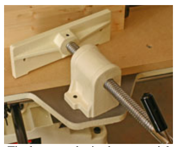
The large work vise has a special quick-adjust feature, plus it can be rotated to make clamping angled or odd shaped work pieces much easier.

positioning and all further adjustments done with the handwheels. That is a huge time saver, along with a boon to accuracy. The table movement gives the JET JFM-5 Hollow Chisel Mortiser a maximum chisel center to fence clearance of 4".