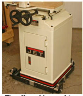
The all-steel base cabinet has storage for the auger & chisel sets and related tools. Add one of our universal mobile bases and the JFM-5 easily goes where you can use it best.

The JET JFM-5 Hollow Chisel Mortiser is mounted atop an all-steel, enclosed base cabinet. The cabinet is 14"-wide, 16"-deep, 23 ½"-tall and features an internal storage area for chisels, related tools and accessories. The base cabinet puts the JET JFM-5 Hollow Chisel Mortiser table surface at a comfortable 31 ½" height above the floor. The overall height of the JET JFM-5 Hollow Chisel Mortiser on its base cabinet is 61".