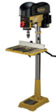
The PM2800 18" Drill Press has all of the capacity and features you need in a solid accurate, value-laden package.

The extensive use of high-end iron castings and heavy-duty steel components make the POWERMATIC 18" Drill Press as durable as it is versatile. The 3 1/8"-diameter steel column, over-sized quill and cast iron table system provide the rigidity that makes this an exceptionally accurate and repeatable drill press. The all cast iron 11 7/8" by 19 5/8" base contributes to that stability and the vibration-dampening 287-pound overall weight. In addition, the base comes with holes in each corner for securing the POWERMATIC 18" Drill Press to a suitable floor. It also has a pair of slots in the machined center section for attaching work holding devices.