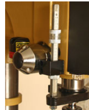
The keyless 5/8"-capacity chuck (left) and easy to use depth controls (right) make the PM2800 Drill Press versatile and easy to use.

Finger-operated depth stops make it easy to limit drilling depth for repetitive jobs. This stop system also makes it easy to hold the spindle at a specific