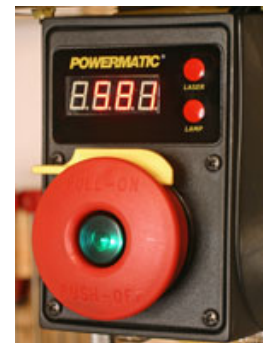
The full 1 HP motor (left) and control panel (right) make controlling the PM2800 for your job easy. The green pilot light in the center of the red pull On, push Off button is an indication that the PM2800 is connected to electrical current.