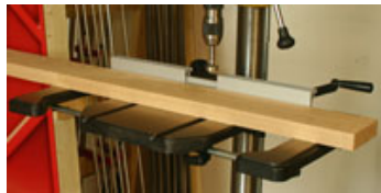
The combination of an 18" swing, the large vertical capacity and the expandable table make working with large pieces easy and safe on the PM2800 Drill Press.

The 68"-tall by 31.5"-deep and 23.5"-wide overall dimensions are the result of design criteria specifying capacities that make the POWERMATIC PM2800 18" Drill Press an exceptionally useful and versatile machine. In addition to the full 18" swing, the POWERMATIC 18" Drill Press has a chuck to base clearance of 46" and a maximum chuck to table capacity of 30"!