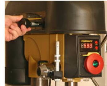
The variable speed control is operated by moving the lever (when the PM2800 is running) on the side of the head. This placement makes it easy to adjust speed and watch the LED readout at the same time.

To make applying that power user friendly we added an exterior, single handle variable speed control that lets you choose the speed (always set while the drill press is running) you need without touching a belt! The 400 to 3000 RPM spindle speed range makes the POWERMATIC 18" Drill Press as flexible as it is powerful.