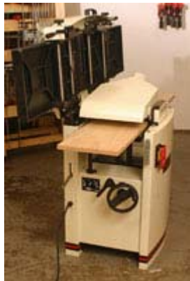
In the planer mode the JJP-12 handles boards up to 12" wide with power to spare.

In planer mode the material feed roller system is engaged by moving an exterior handle to the On position. That produces a material feed rate of 20 FPM. (feet per minute) The control lever is moved to the Off position when the JET JJP-12 Jointer-Planer is changed to the jointing mode.