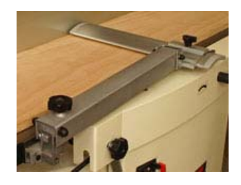
The bridge style guard is very effective and easy to set up.

The bridge style cutter guard may take a little getting used to but is much safer than the "pork chop" shaped guards. This style guard is simple to set up and with just a little experience will actually be easier for many than dealing with the swingaway guards.