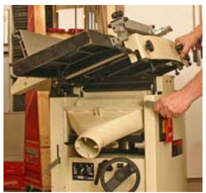
Changing from jointing to planing or back on the JET JJP-12 is fast and simple. Unlock the jointing deck, lift it to its upright position, flip the dust collector into planing position and engage the feed rollers. It takes less time to do than to describe! Going back to jointing is just as

From the beginning, along with accuracy, capacity and durability, developing a fast, easy way to change between jointing and planing modes was high on the design criteria list. The JET JJP-12 Jointer-Planer sports a very simple, tool-free hinge based system that allows changing between jointing and planing modes very quickly without having to remove any components.