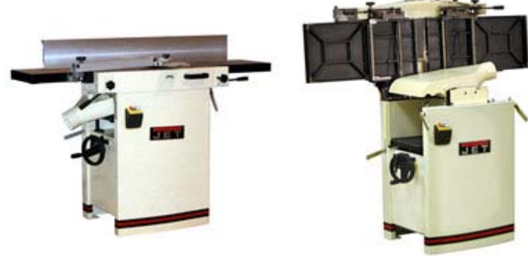
The JET JJP-12 Jointer-Planer brings two crucial woodworking processes, jointing (left) and planing (right) to the shop in one space and money saving package.

A frustrating choice woodworkers often face is whether to get a jointer or a planer first. That choice is made more difficult because these machines compliment each other to dimension, square and smooth the wood. The new JET JJP-12 Jointer-Planer eliminates that problem and brings both capabilities to your shop