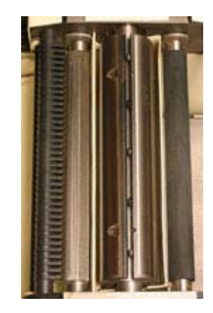
The precision machined 3-knife cutter head and feed roller system (planing mode) make the JET JJP-12 effective.

The JET JJP-12 Jointer-Planer uses a large 2 ¾"-diameter cutterhead fitted with three high quality knives for both jointing and planing operations. The cutterhead turns at 5500 RPM for all operations. The knives are retained with conventional wedge bars and have jacking screws that make setting their height precisely much easier. Because this cutterhead is used for both jointing and planing, setting the knives one time is all that is required.