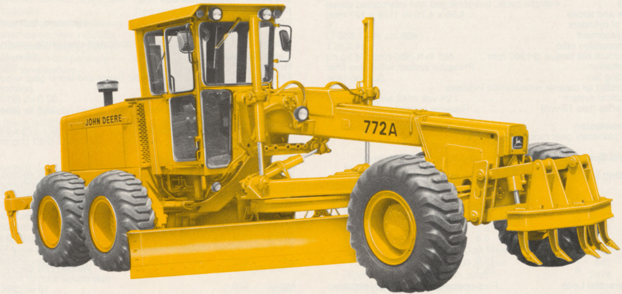
Model shown may include options