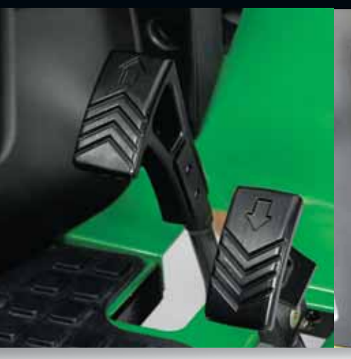
Twin Touch™ transmission pedals make it easy to switch from forward to reverse, and let you rest your heel on the platform the whole time you drive.