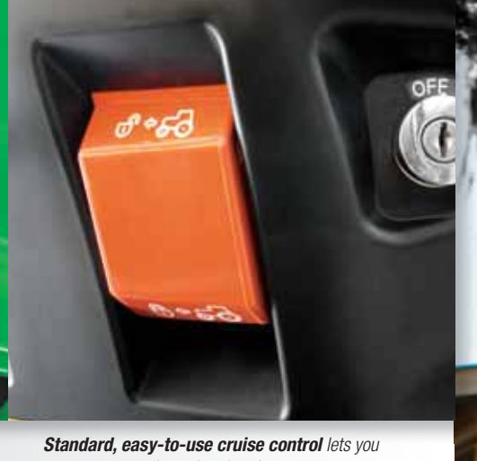
concentrate on the task at hand.