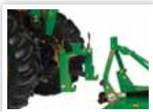
2001 iMatch™ Quick Hitch

variety of mid- to large-sized jobs. With over 125 available attachments, our 3000 Series Tractors can help you get more done than you could ever imagine. Read on to find the tractor that's right for you.