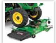
2008 AutoConnect™ deck