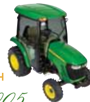
2005 ComfortGard™ Cabs