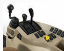
Right-hand control center