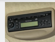
AM/FM radio w/CD