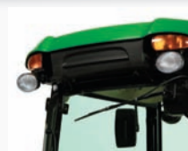
Rear work lights