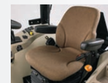
Deluxe air ride seat